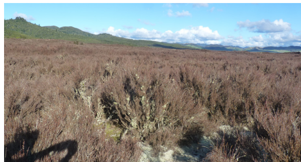
Frost Flats in the Rangitāiki.