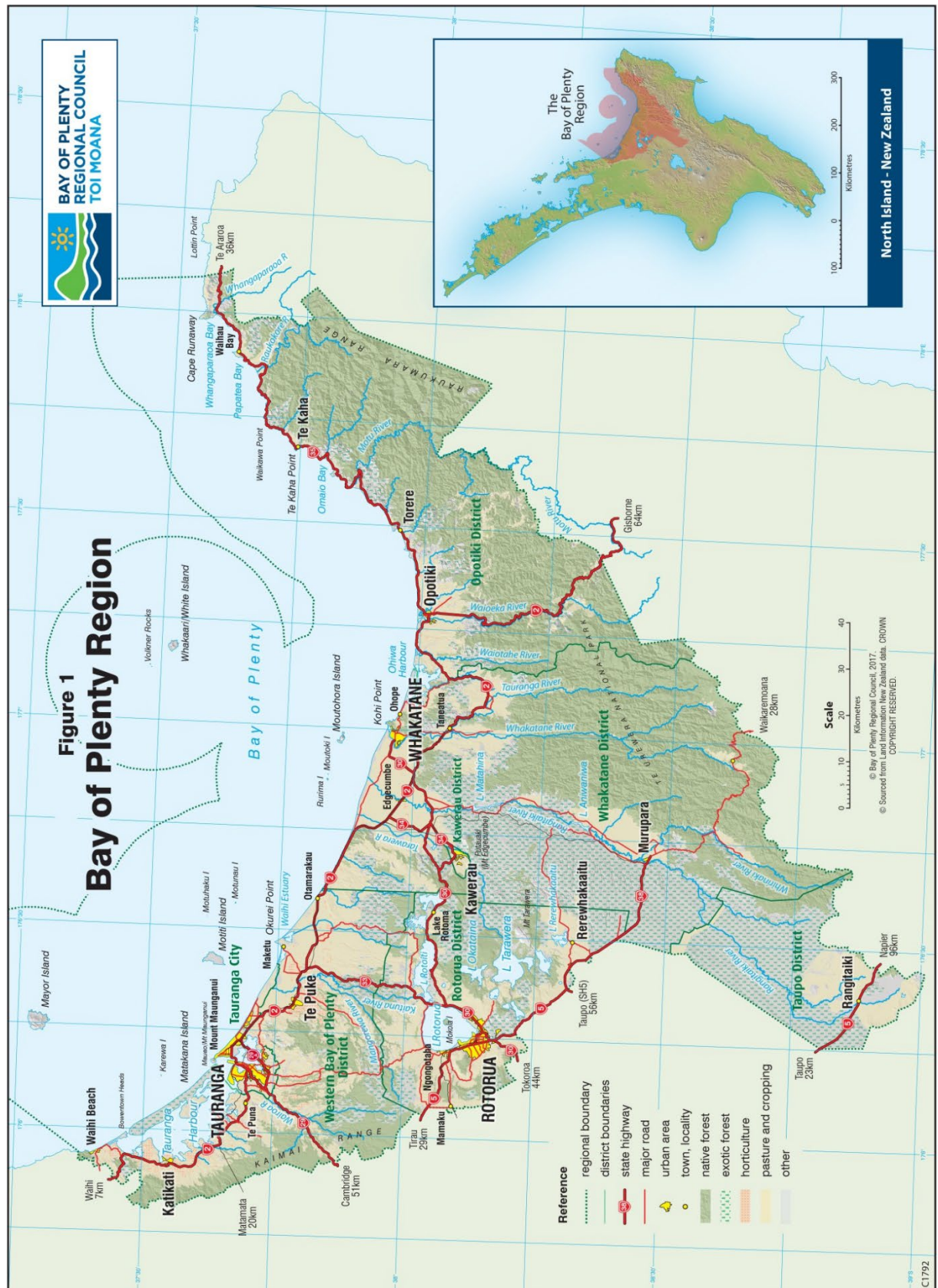
Map 1 – Bay of Plenty Region