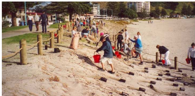
Photo – Dune protection and planting (Main Beach – Mount Maunganui)

How might the current cultural and natural environment be different now if this decision had not been made?