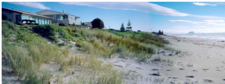
Photo – Housing on the dunes (Pāpāmoa and Mount Maunganui)

The decision to allow high rise apartment buildings in downtown Mount Maunganui – how did this decision influence the surrounding natural and cultural environment? – How might the current cultural and natural environment be different now if this decision had not been made?