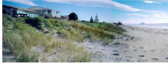
Photo – Housing on the dunes (Pāpāmoa and Mount Maunganui)

How might the current cultural and natural environment be different now if this decision had not been made?