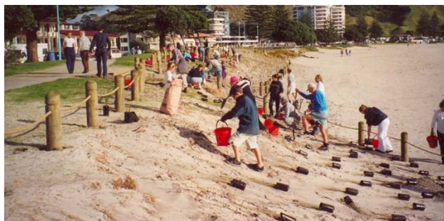
Photo – Dune protection and planting (Main Beach – Mount Maunganui)

The decision not to allow building and development on Mauāo (Mount Maunganui) – how did this decision influence the surrounding natural and cultural environment? How might the current cultural and natural environment be different now if this decision had not been made?