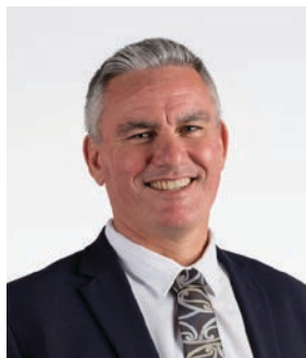
Hon David Parker Minister for the Environment

A handwritten signature in blue ink, appearing to read 'Kelvin Davis'.