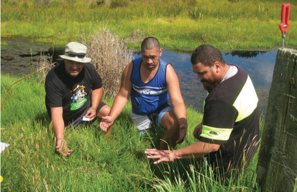
Te Hiku dune lakes project team releasing new manuka plantings at the Split Lake near Kaitaia.