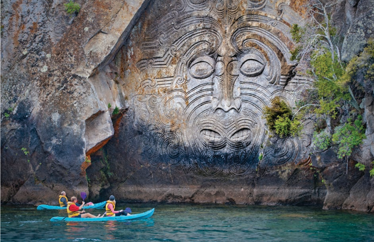
Rock carvings by master carver Matahi Brightwell at Mine Bay on Lake Taupō.