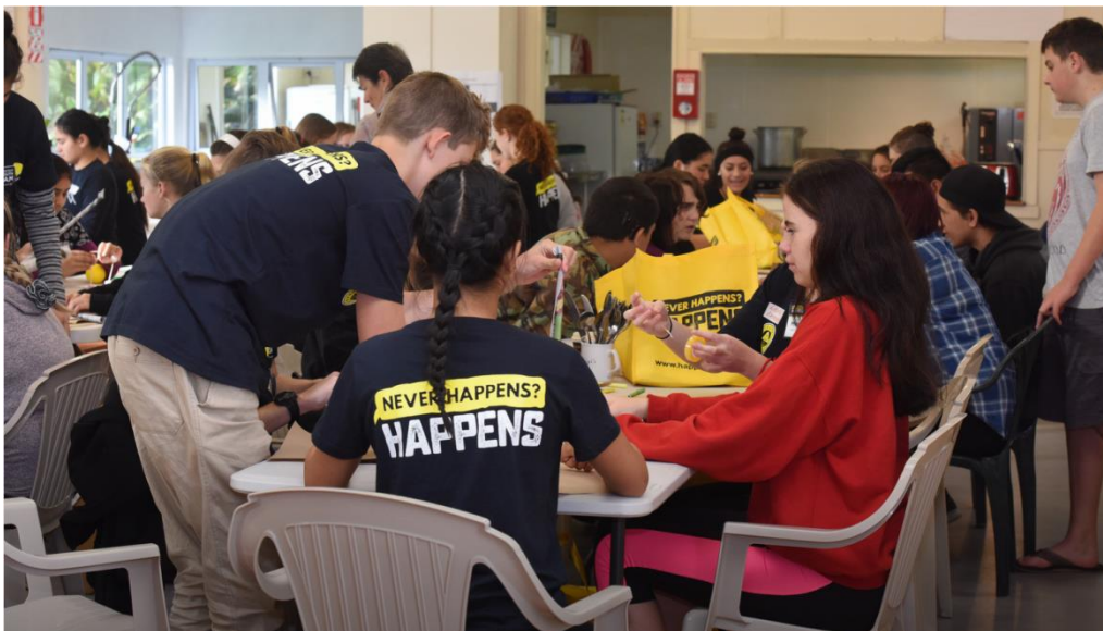
Figure 2: Students from different schools worked together to solve challenges under pressure