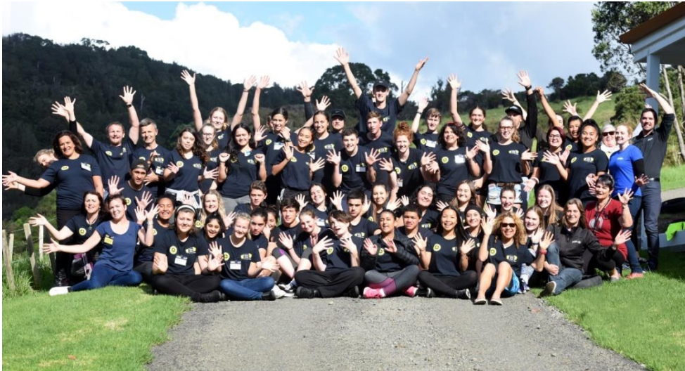
Figure 1: Taiohi Taiao Youth Jam Ambassadors 2018