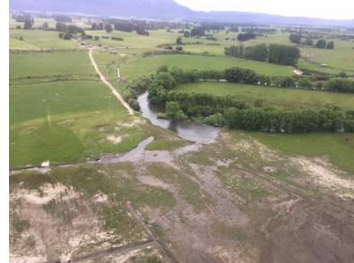
RT190 works plan