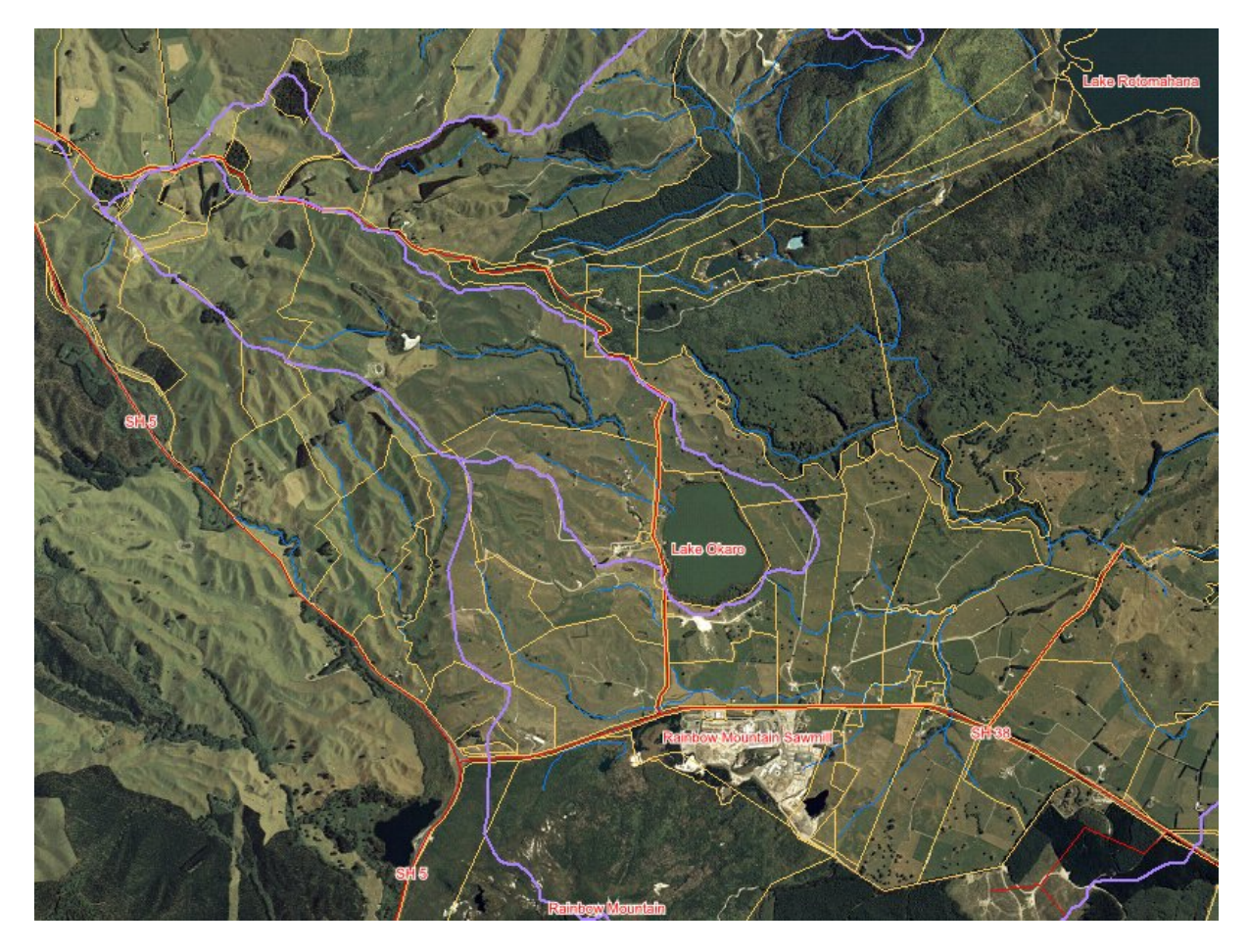
Figure 1 Lake Okaro and surrounding area

Recreational uses of the lake include boating, water skiing and fishing. The Medical Officer of Health warns against contact recreation when cyanobacterial blooms are on the lake. Lake water with cyanobacterial blooms may contain toxins. Drinking these toxins can harm the liver, the nervous system or the gastrointestinal tract. The toxins can affect humans, livestock, birds, and fish to a lesser extent. Skin contact with the toxins may trigger allergic reactions or asthma.