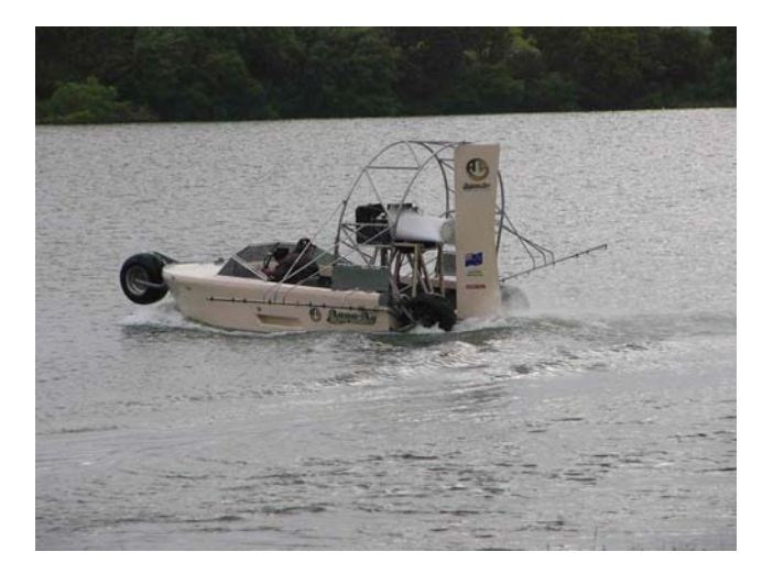
Figure 3 Lake Okaro alum application

The alum sank into the lake on application without affecting the lake's pH. The next day the alum was only partially located but on the following day it was distributed throughout the surface waters. It was surmised that the alum had plunged to the thermocline (the temperature drop between upper and lower waters) and temporarily accumulated there until the surface water currents gradually mixed it. After five days the alum was thoroughly mixed throughout the surface waters.