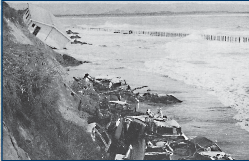
Ohiwa 1976 - Gazetted as 'Stock Reserve' in 1906