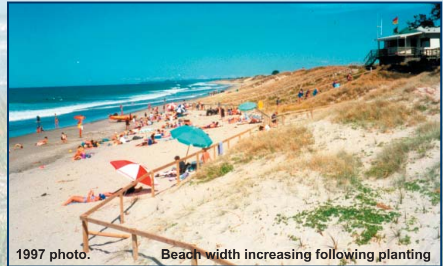
1997 photo. Beach width increasing following planting