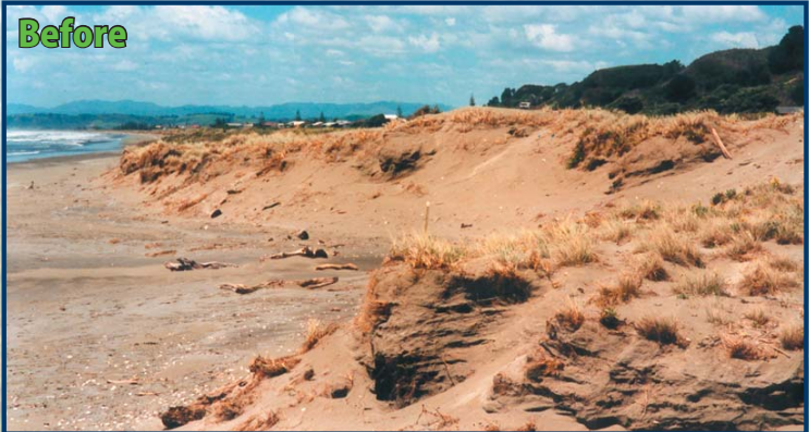
Before A storm water drain (by peg in middle of photo) was lowering beach level, which promoted wave attack on the dune front slope.