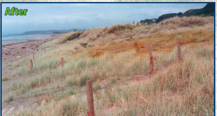
After Whakatane District Council removed the storm water drain and formed a drainage swale behind the dune. Excess sand from the swale was used to fill in the embayment. Ohope Coast Care members planted the sand with functional dune plants.