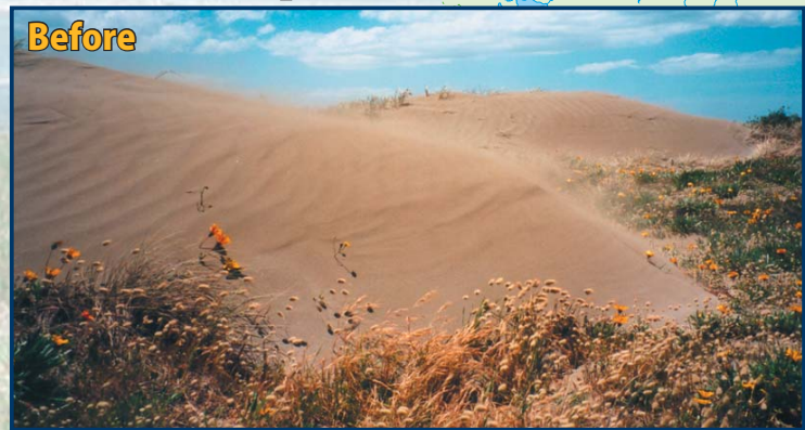
Before The eroded front slope encouraged wind erosion of sand over the crest, to be deposited on the backslope. This untethered sand was smothering daisies and weeds, and blowing towards the road and houses.