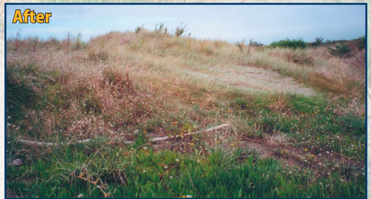
After The wind deposited sand was also planted with functional dune plants by Ohope Coast Care, to result in a functional and stable dune.