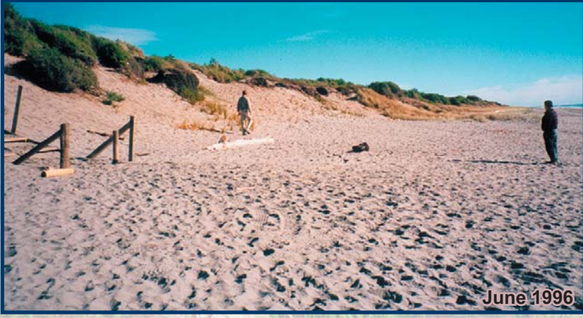
Casual pedestrian impact at Pacific Parade Access.