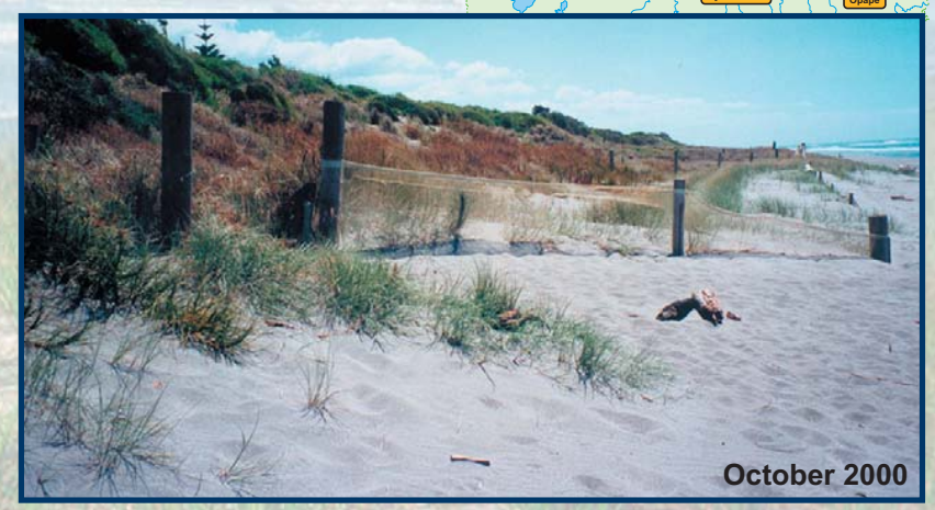
The original planting is effectively trapping sand. New posts were placed at the base of the steps as old ones became buried.