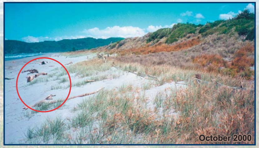
Four years after planting, the fence disappearing.