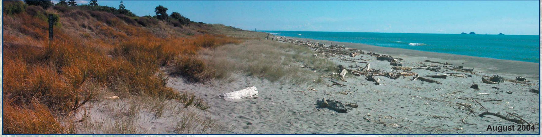
Continuing sand accumulation is raising front dune height, burying the fence and improving beach width.