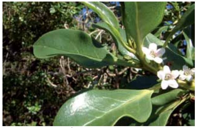
Ngaio or Myoporum laetum