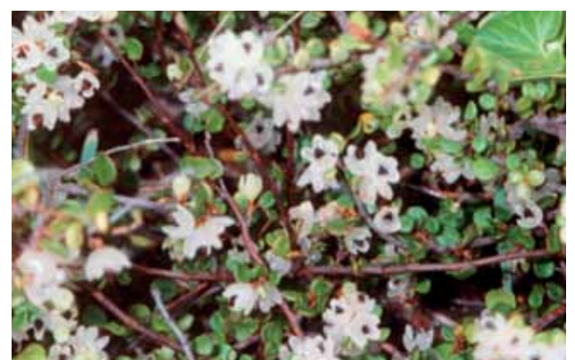
Pōhuehue or wire vine or Muehlenbeckia complexa

that this butterfly might be especially important for another dune plant – the ngaio.