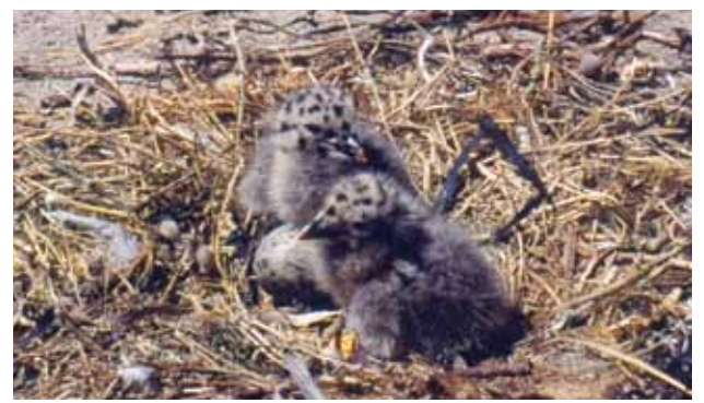
Dotterel chicks in their nest

There are baby NZ Dotterel chicks in the eggs in their nest. Do you think you would see the nest of eggs if you were driving along the beach in a quad bike or a four wheel drive?