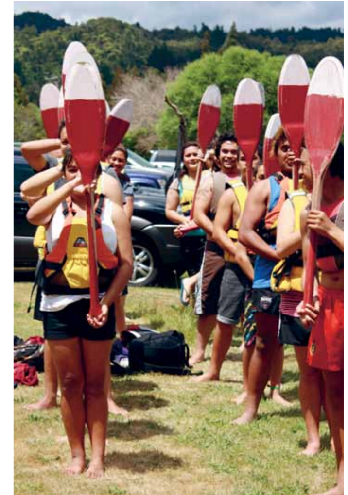
Youngsters prepare to paddle a waka on the lake.