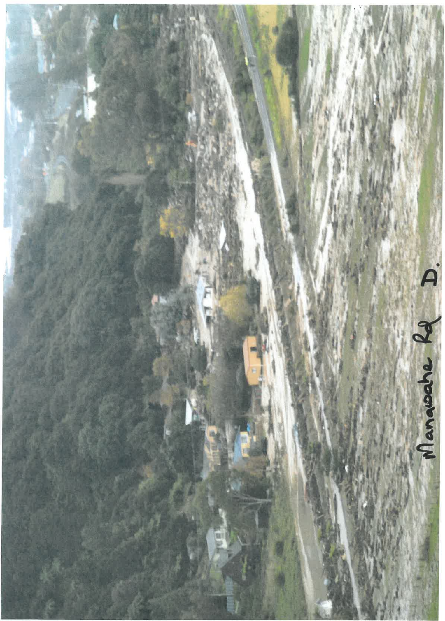
Manawake Rd D.