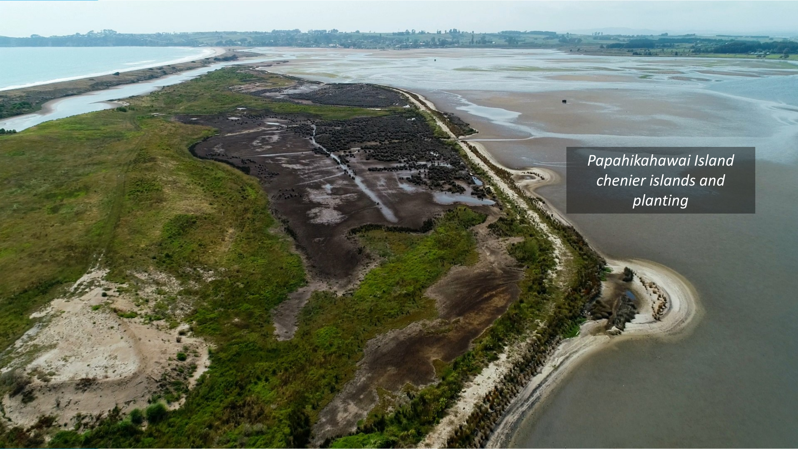
Papahikahawai Island chenier islands and planting