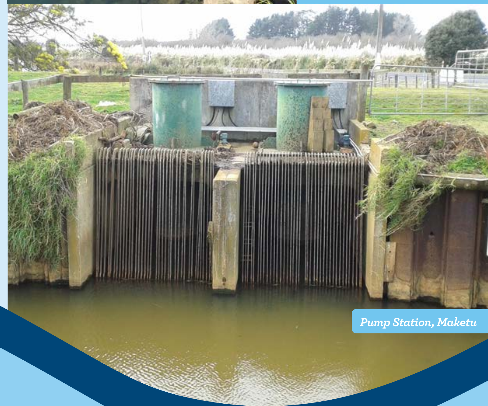
Pump Station, Maketu

Bay of Plenty Regional Council's flood protection assets include: