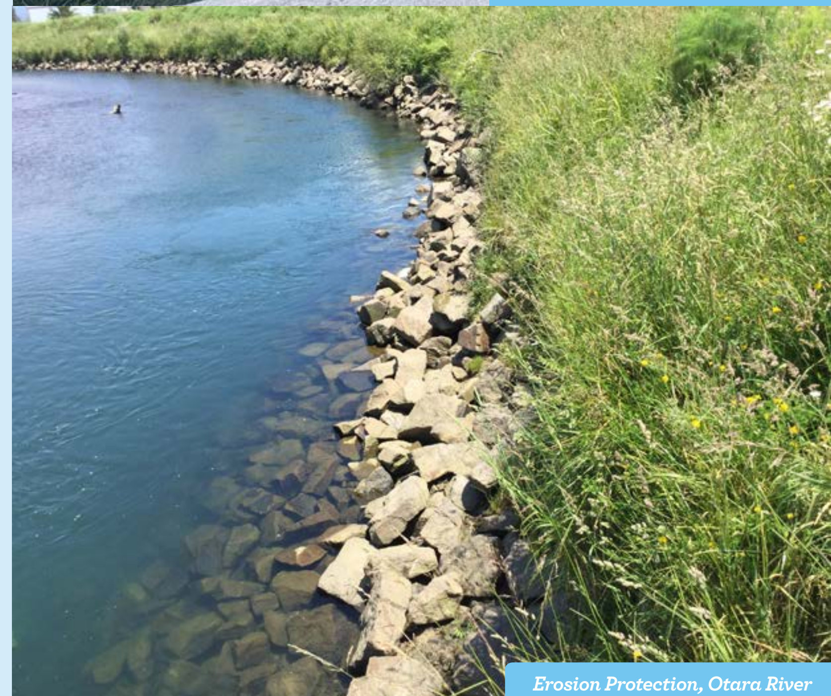
Erosion Protection, Otara River