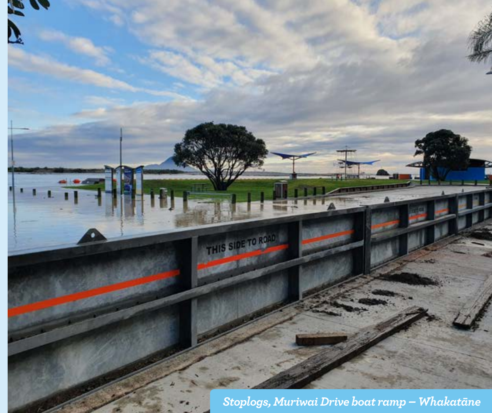
Stoplogs, Muriwai Drive boat ramp – Whakatāne

The Bylaws outline when you need to talk with Council and if necessary apply for a Bylaw Authority. This ensures we work together to develop the best approach to managing activities within Bylaw Applicable Areas.