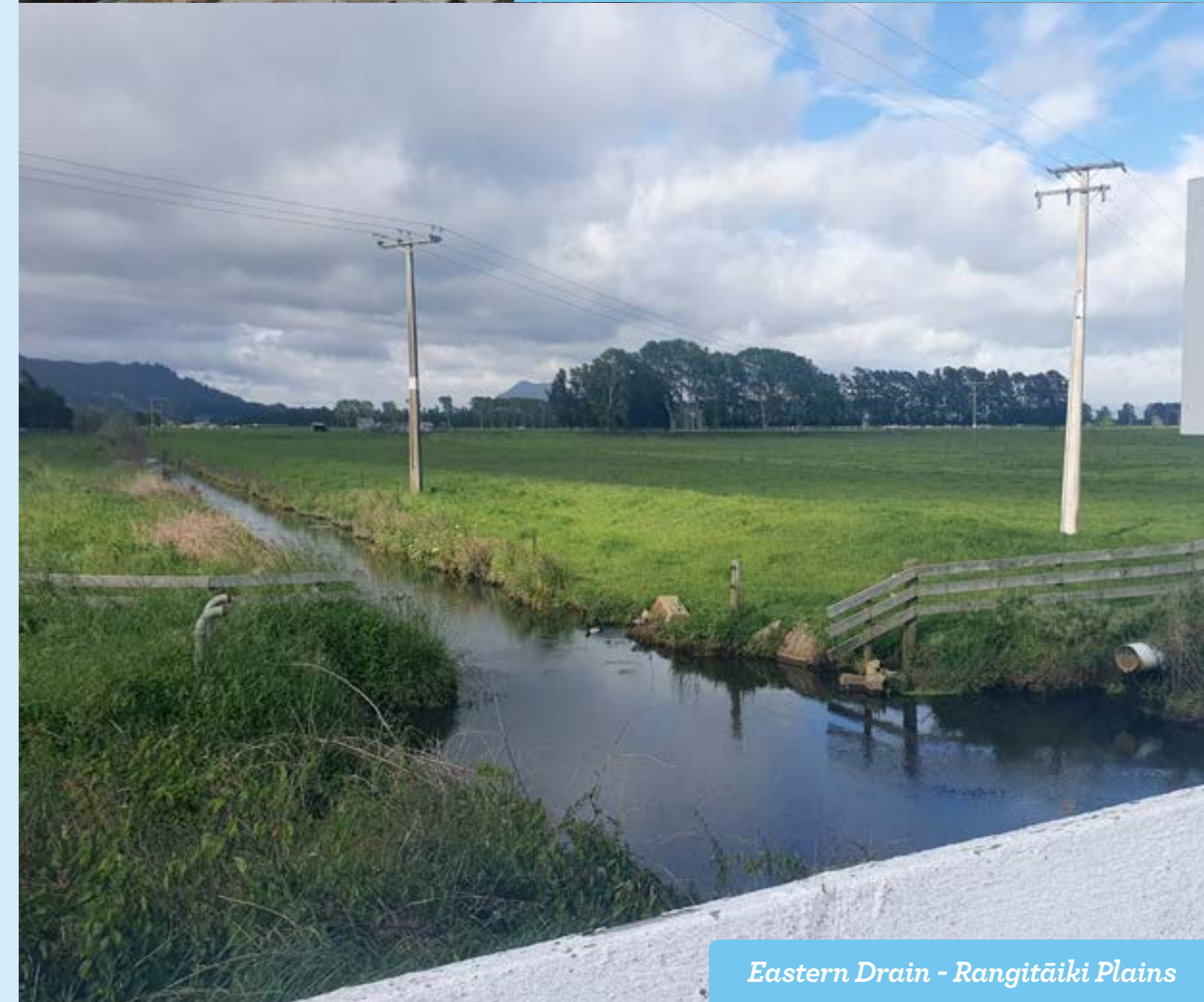
Eastern Drain - Rangitāiki Plains