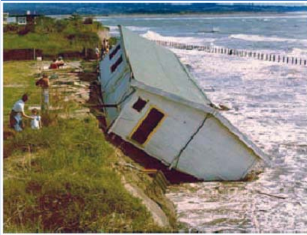
Figure 4.1: Ōhiwa Spit , 21 April 1976.

several houses were lost to the sea over the next decade, despite various attempts to protect parts of the coast with makeshift seawall and railway-iron protection. A series of storms in the mid- to late 1970s resulted in several properties falling into the sea (Figure 1). One particular storm over 4 days (18-21 April 1976) resulted in up to 29m of duneline retreat. Buildings that survived the storms were removed from the coastline in 1976.