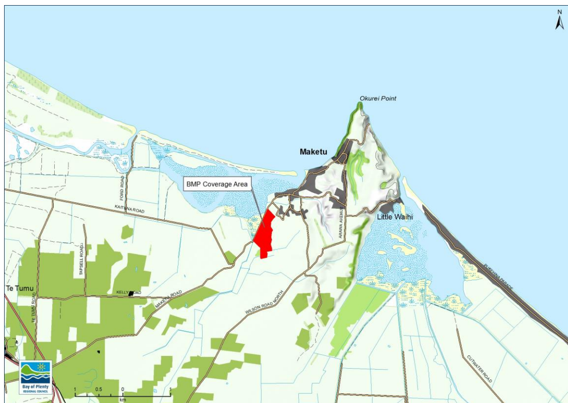
Figure 1. Map showing the approximate location of the Whakapoukorero Wetland's (Highlighted red).

This report has been prepared as part of the required assessment of effects accompanying a resource consent application under the Resource Management Act 1991 (RMA) and to identify any requirements under the Heritage New Zealand Pouhere Taonga Act 2014 (HNZPTA). Recommendations are made in accordance with statutory requirements.