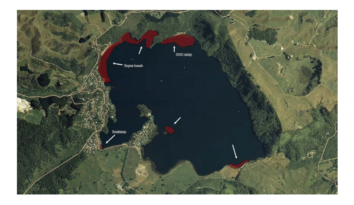
Figure 1 Lake Ōkāreka with areas marked where hornwort was located during the 2012 and 2013 surveillance period