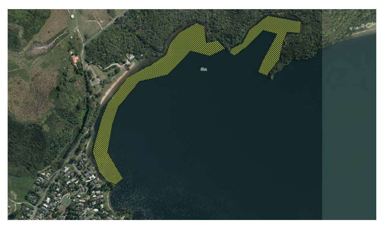
Bay east of Acacia Point Road – proposed area for spraying (1.5 ha)