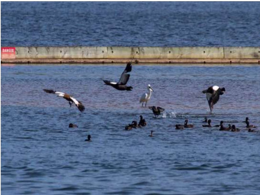
Plate 1: Royal spoonbill at the Ōhau Channel delta on 21 November 2012, along with New Zealand dabchick, New Zealand scaup, and paradise shelduck.

A total of 48 bird species have been recorded over the period May 2005 to May 2013 (Table 2). Thirty of these species are indigenous, while 18 species are introduced (including mallard/grey duck hybrids). Ten of the indigenous species are classified as ‘Threatened’ or ‘At Risk’ by Miskelly et al. (2008). Royal spoonbill were recorded for the first time in this study in 2012, with one bird recorded in both the October survey at Ōhau Channel delta and the November survey (Plate 1). Of the species recorded previously during the first six years of this study, six were not recorded in the June 2012 to May 2013 period: Australasian bittern, feral goose, Australasian shoveler, California quail, kereru, and greenfinch. None of these species were commonly recorded in monthly surveys in the two years prior to wall construction.