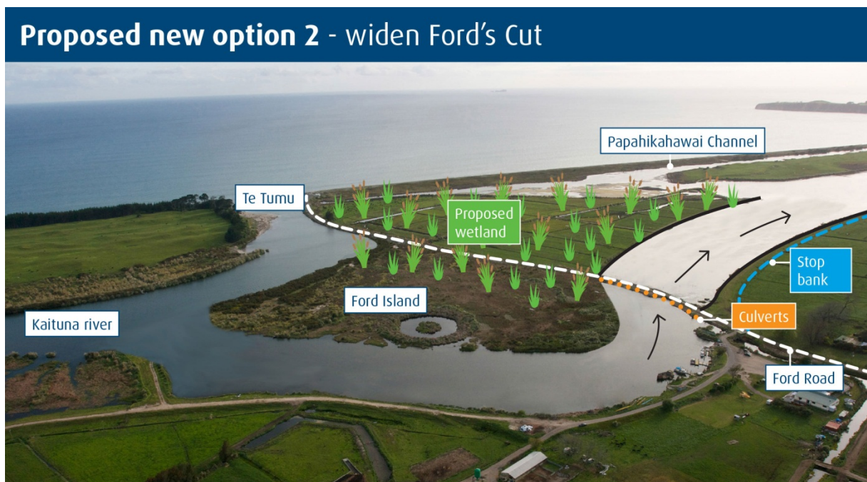
Figure 5 Option 2: Widen Ford's Cut at Te Tumu showing the location of channels, proposed wetlands and stopbanks.

Option 2 is predicted to re-divert 487,000 m 3 per tidal cycle which is about 17% of the total river volume (the same as Option 1). This volume is equivalent to 34% of the mean tidal volume of Ongatoro/Maketū Estuary. The freshwater fraction of the re-diverted flow is predicted to be 269,000 m 3 per tidal cycle, or 55%. This option will direct re-diverted flows into the southern part of Ongatoro/Maketū estuary, but there will still be some flows around the northern side of Papahikahawai Island. Option 2 is shown in Figure 5.