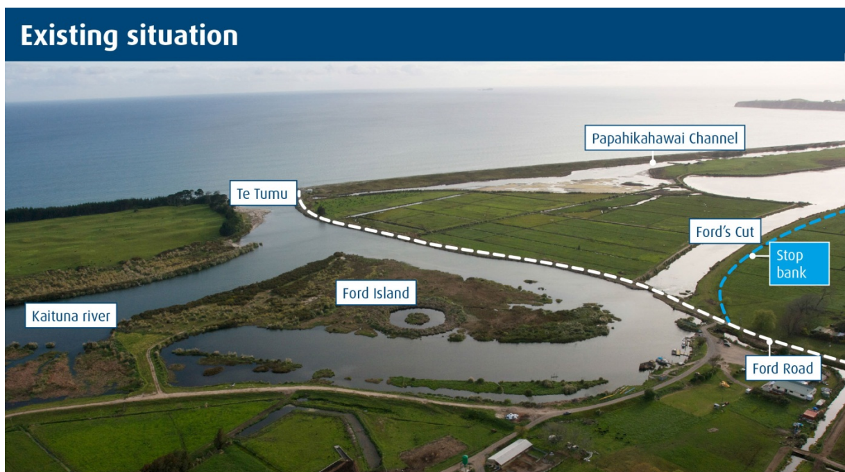
Figure 3 Existing situation at Te Tumu showing the location of channels and stopbanks.

The Department of Conservation holds the existing resource consent for the re-diversion through Ford's Cut, and is in the process of applying for a five year renewal of this through to 2018.