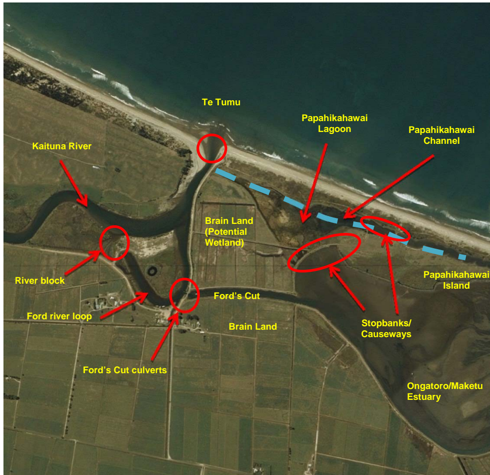
Figure 1 Key features.

The key features of the area are shown in Figure 1.