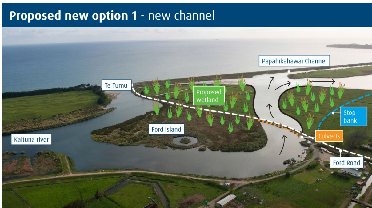
Figure 4 Option 1: New channel at Te Tumu showing the location of channels, proposed wetlands and stopbanks.

Option 1 is predicted to re-divert 487,000 m 3 per tidal cycle which is about 17% of the total river volume. This volume is equivalent to 34% of the mean tidal volume of Ongatoro/Maketū Estuary. The freshwater fraction of the re-diverted flow is predicted to be 269,000 m 3 per tidal cycle, or 55%. Option 1 will direct re-diverted flows around both sides of Papahikahawai Island as was the case prior to 1956, and is shown in Figure 4.